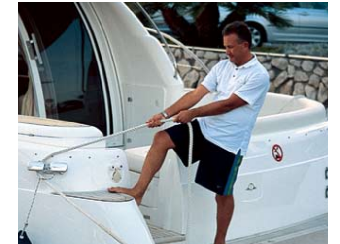
Without Yacht Controller.