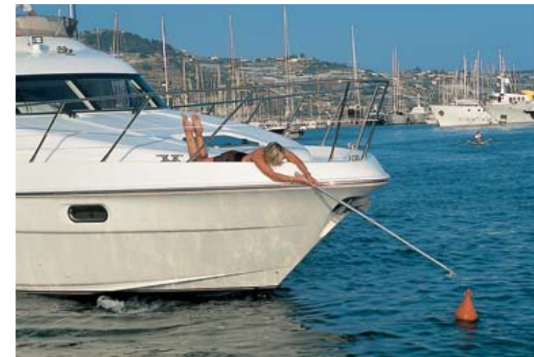
No longer in this dangerous and uncomfortable position.

No more dangerous, uncomfortable positions or wrong instructions from the crew trying to get a line to a floating buoy. With Yacht Controller, you can bring your boat directly alongside at the bow or stern and pick up the buoy either yourself or standing next to the crew in complete safety.