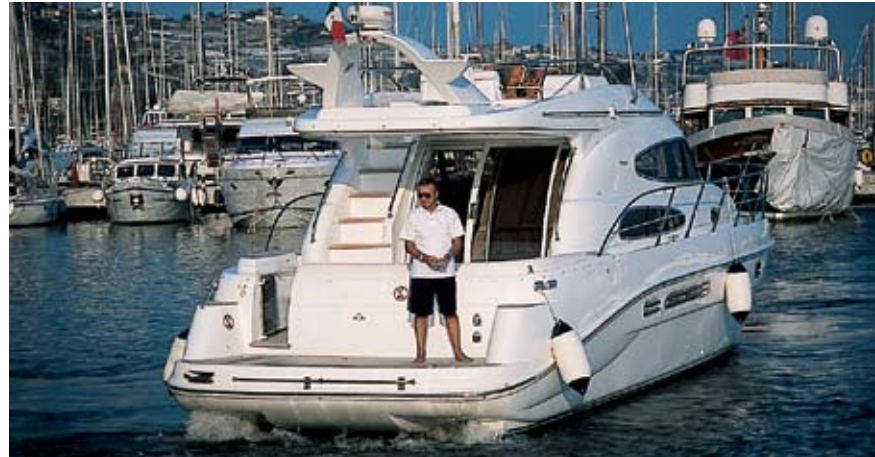
Approach manoeuvre executed directly from stern with full view and complete control.

The Yacht Controller is always on hand enabling you to correct any adverse movement caused by wind or tide.