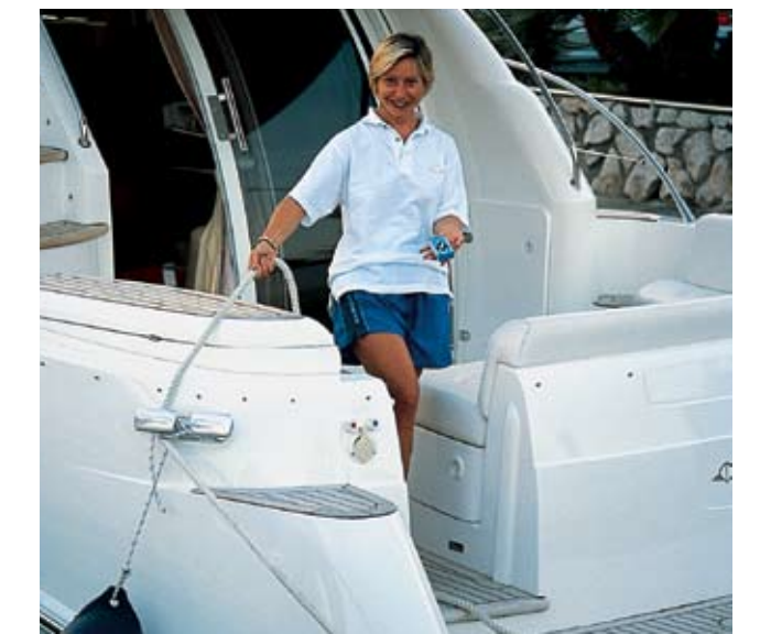
With Yacht Controller.