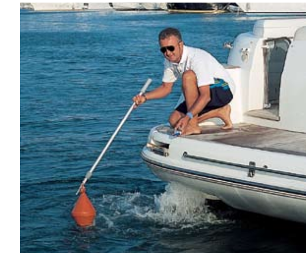
Retrieve items simply and safely from the stern.