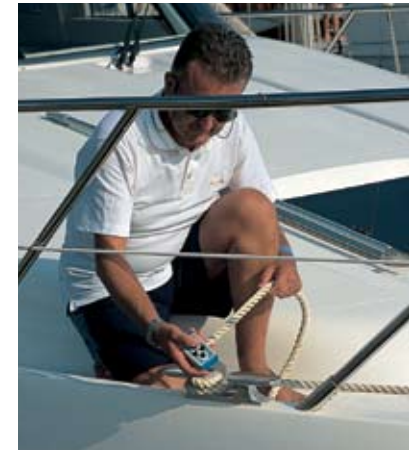
Tying bow mooring lines to a buoy, anchor or dock is easy and controllable.