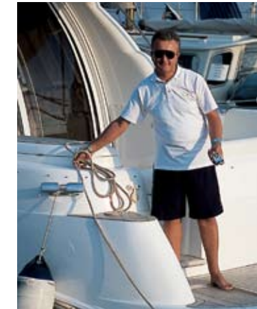
Fixing the lines from the stern becomes effortless.