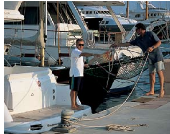
Handling lines while maintaining easy control of the boat.