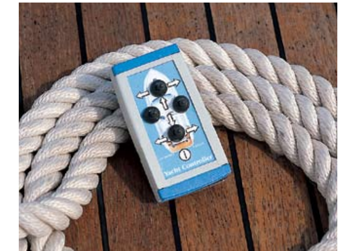
Wireless remote controller.